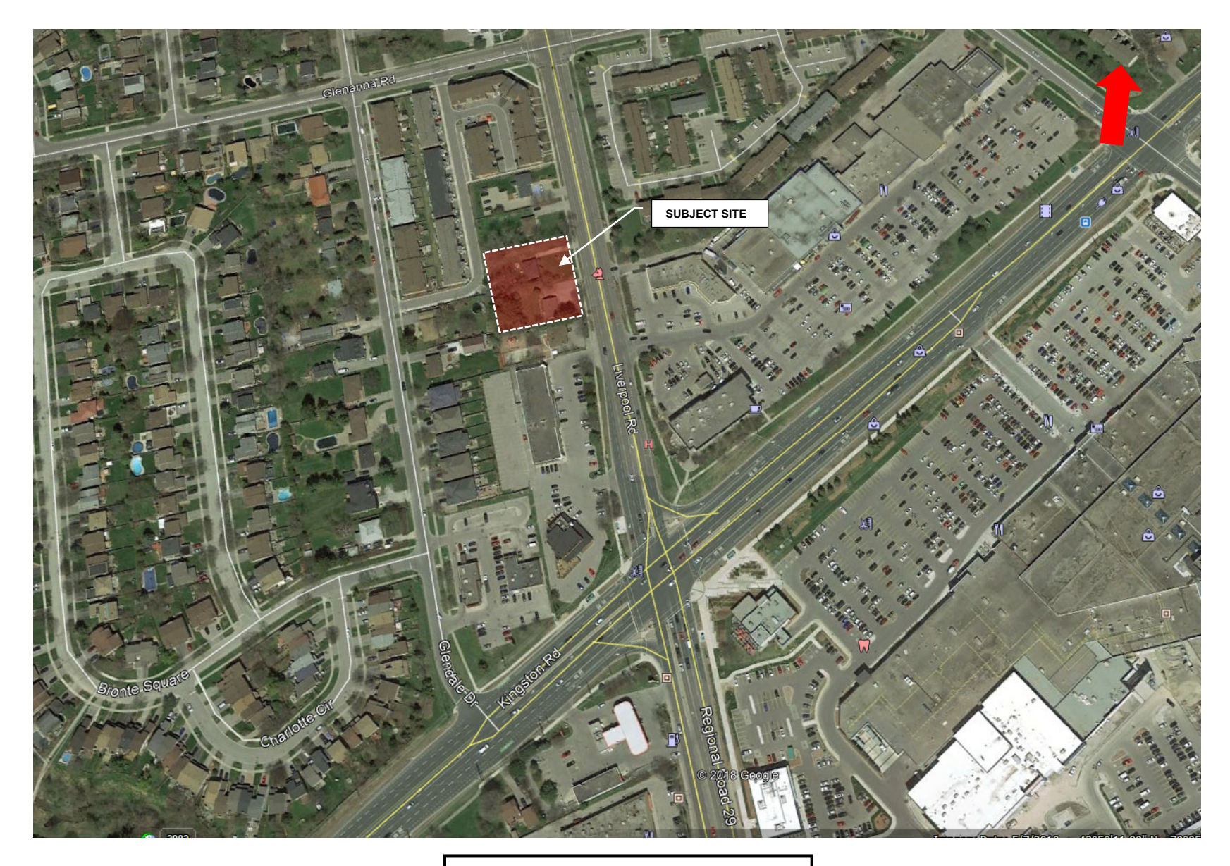
FIGURE 1 KEY PLAN