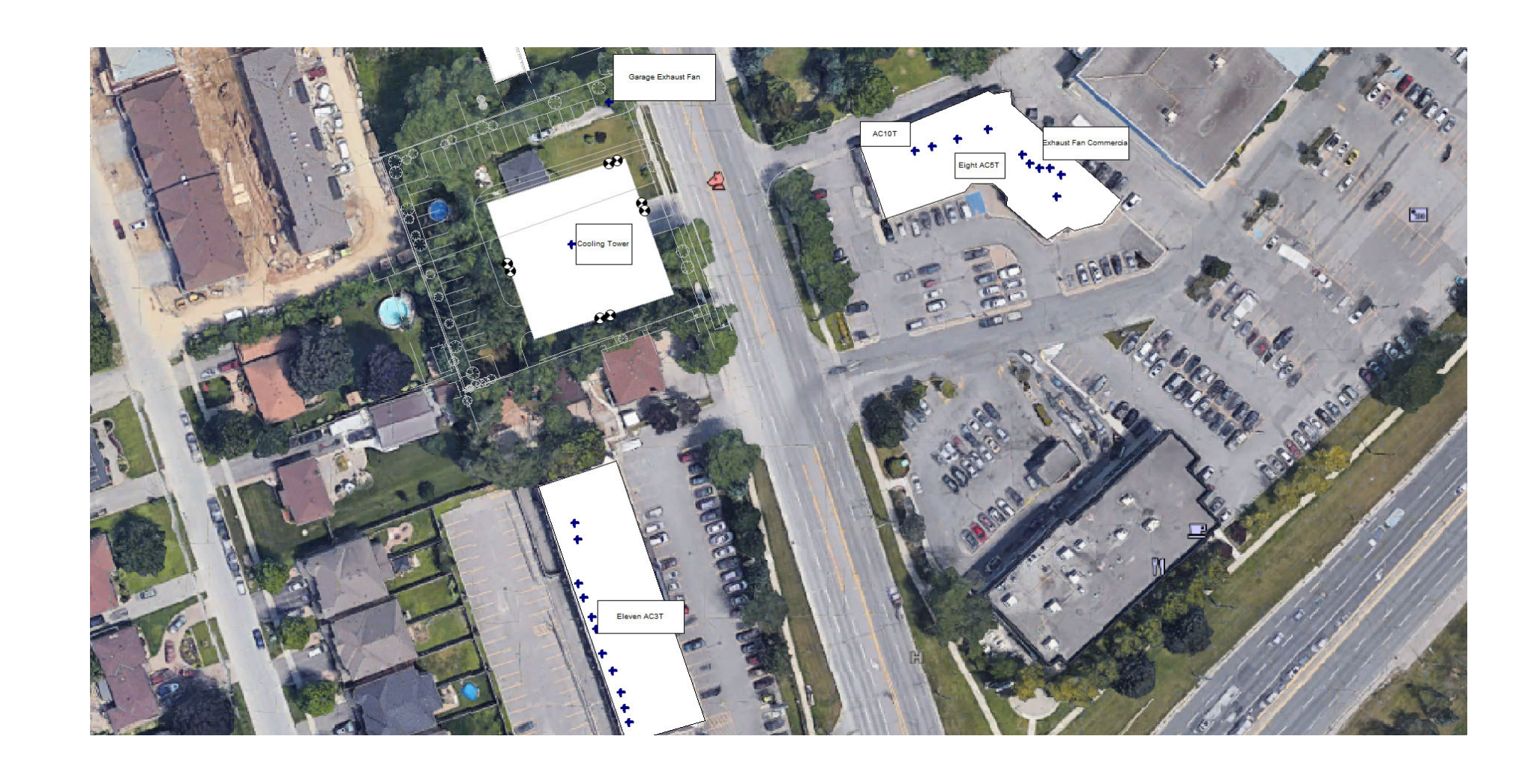
FIGURE 4 STATIONARY SOURCES OF NOISE