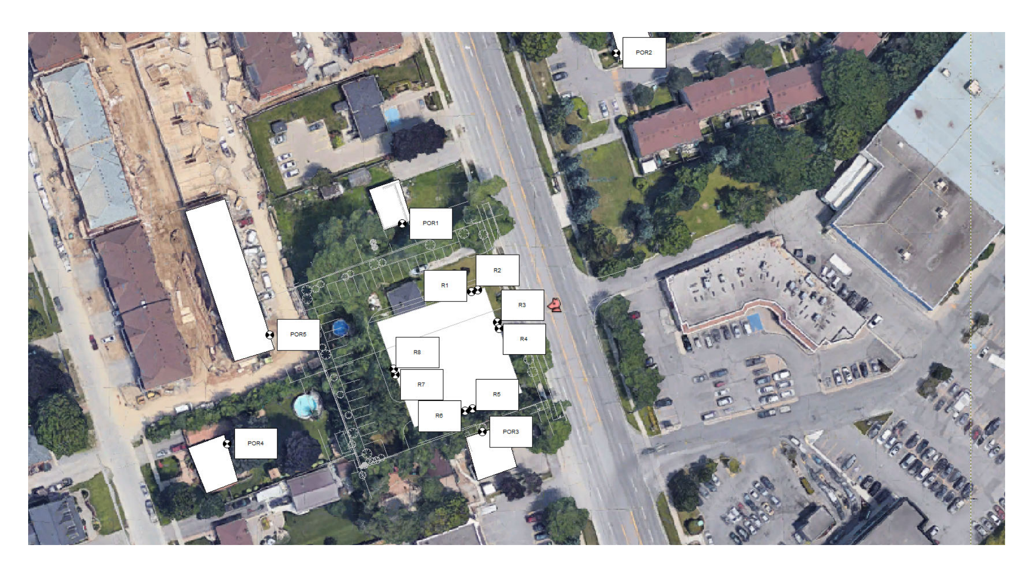
FIGURE 5 RECEPTOR AND POINTS OF RECEPTION FOR STATIONARY SOURCES OF NOISE