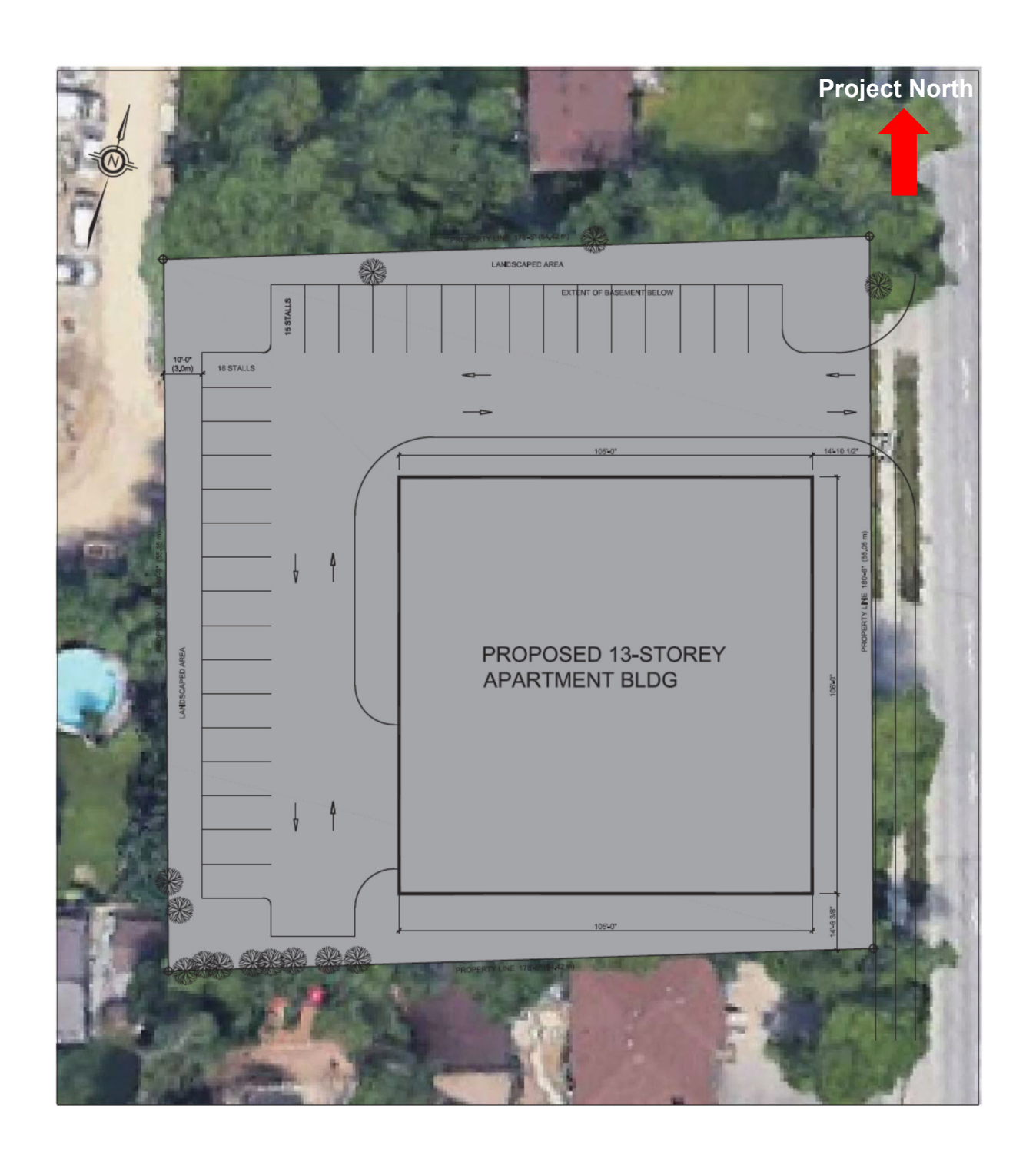
FIGURE 2 SITE PLAN