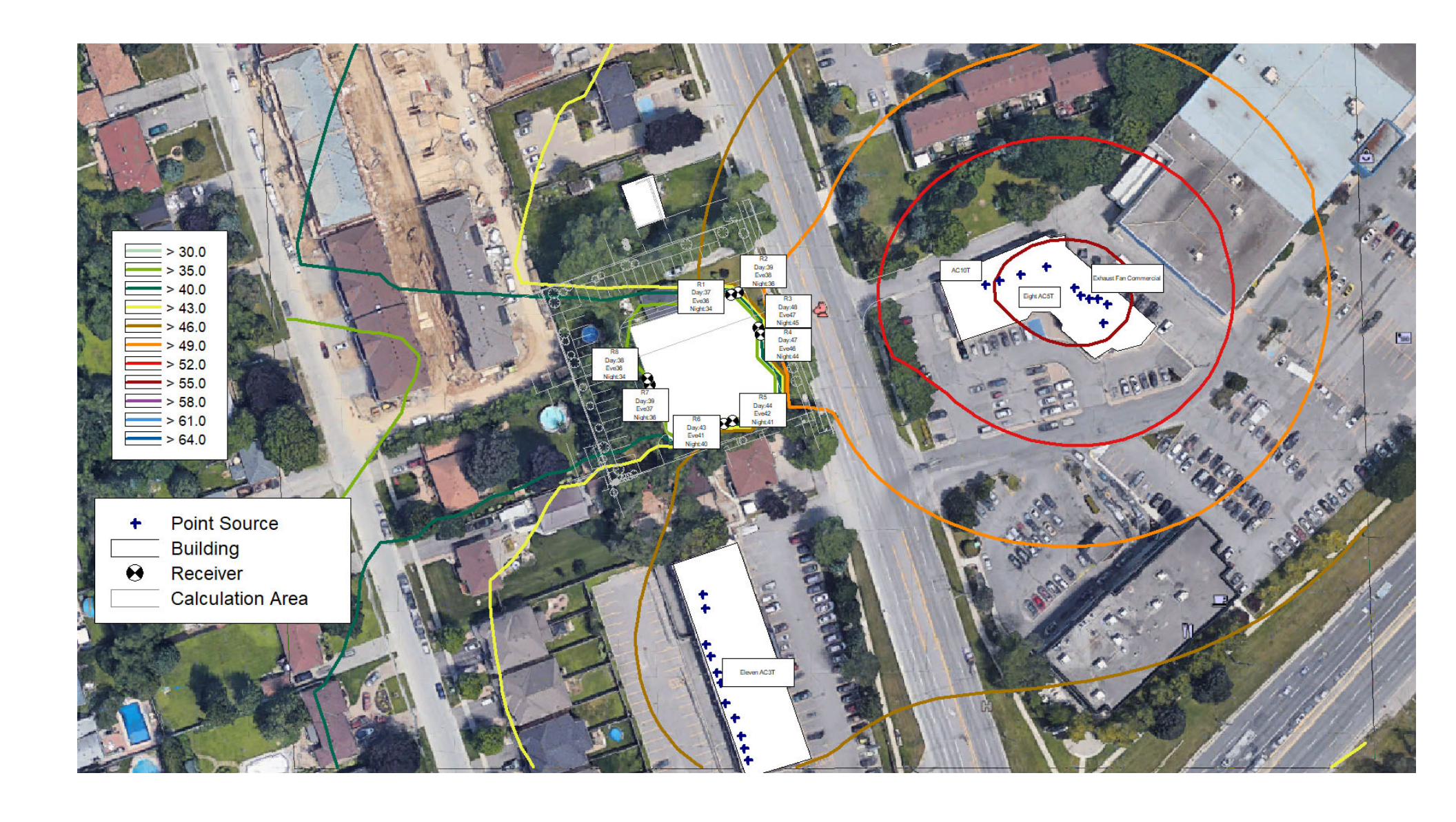
FIGURE 6 UNMITIGATED EXTERNAL STATIONARY SOURCES OF NOISE