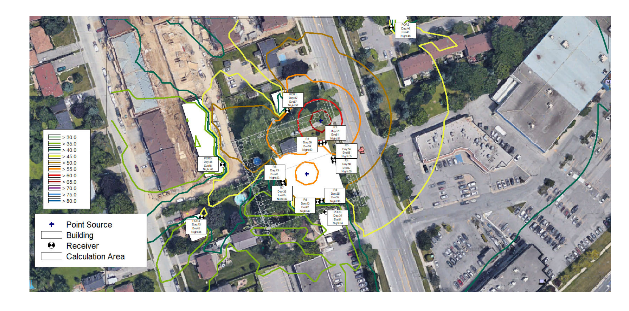
FIGURE 7 UNMITIGATED INTERNAL STATIONARY SOURCES OF NOISE