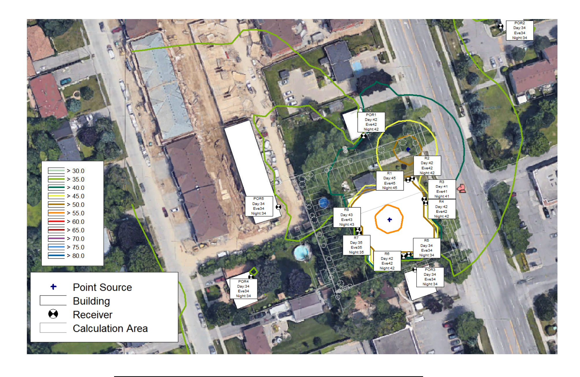
FIGURE 8 MITIGATED INTERNAL STATIONARY SOURCES OF NOISE