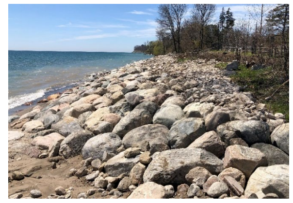
Beachfront shoreline restoration at Rotary Frenchman's Bay West Park

A shoreline stabilization project was completed in the spring of 2022 in Rotary Frenchman's Bay West Park, as part of the Parks Master Plan implementation. It involved the removal of old cottage foundations and the addition of boulders to protect the Lake Ontario shoreline from wave action and further erosion. Additionally, tree and shrub plantings were completed to restore the area and to further stabilize the lake bank.