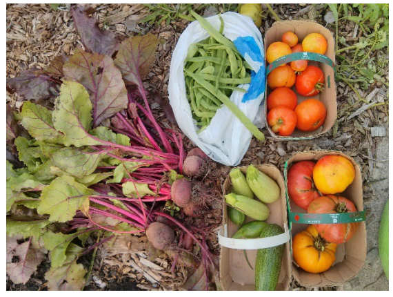
Vegetables harvested at Valley Plentiful Community Garden