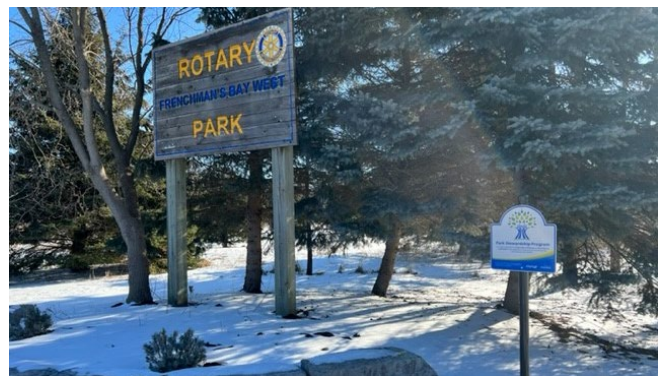
Park Stewardship sign at Rotary Frenchman's Bay West Park

The City regularly supports Pickering community groups, individuals, schools, businesses, and places of worship, who wish to help keep the community clean. Volunteers are involved with litter clean up initiatives through Pickering's 20-Minute Makeover, Pitch-in Parties, Plastics and Litter Challenge, and the Provincial Day of Action on Litter. This year, 40 community cleanups took place throughout the City. The City supported their efforts by providing bags, gloves, and pick-up of the collected materials.