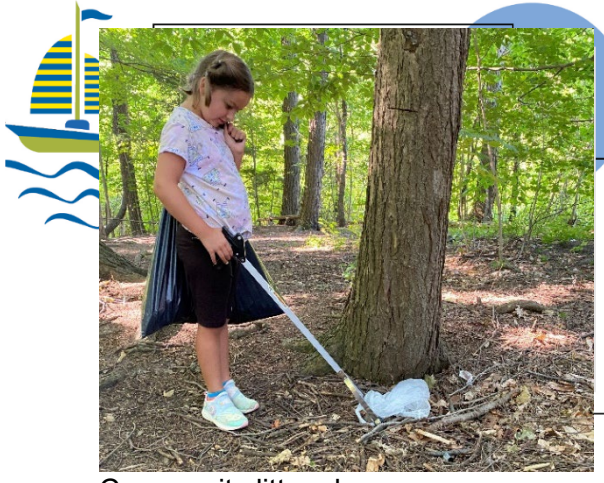
Community litter cleanup