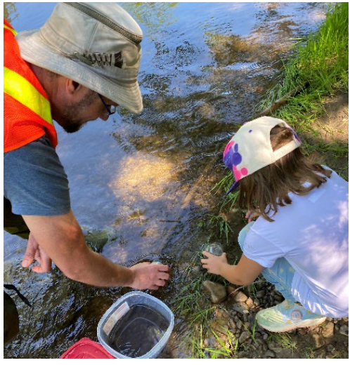
Atlantic Salmon release at Duffins Creek

The City partnered with Smart Commute Durham to celebrate Bike Month from June 1 - 30. Bike Month brings together families, employers, commuters and community organizations to promote cycling events across the Greater Toronto Hamilton Area. The local events included: bike month pledge and bingo, as well as a cycling challenge and scavenger hunt.