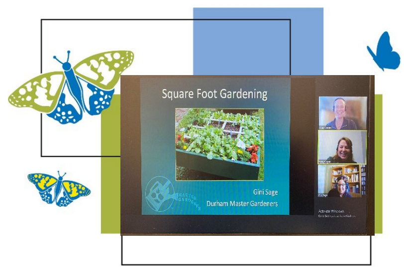
Earth Month gardening webinar