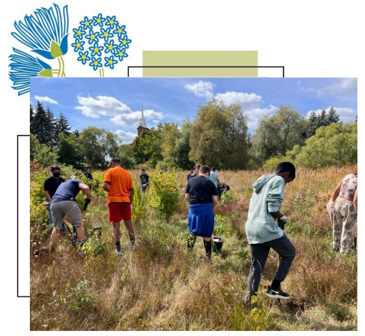
Tree and shrub planting with Dunbarton High School students

The City partnered with Elexicon Energy to complete many pollinator initiatives this year, including the coordination of several planting events. Community groups and volunteers helped the City plant over 380 nectar-producing plants in 6 of Pickering's pollinator gardens. Volunteers from different community garden groups, Dunbarton High School, and the Toronto Conservation Youth Corp, helped plant and maintain these gardens. The pollinator gardens help add diversity to the city's landscape, provide a food source, and enhance the natural habitat for pollinators.