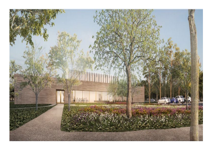
Net zero community infrastructure project