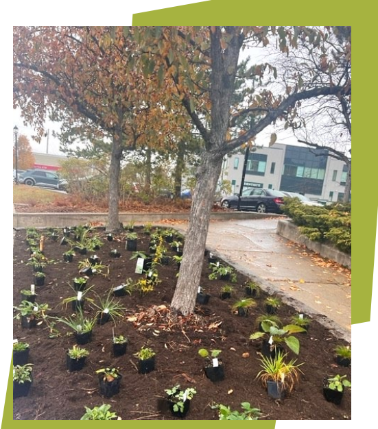
Raised pollinator garden bed near Pickering City Hall

Enhancing and restoring the natural environment to support the well-being and integrity of the air we breathe, the water we drink, the food we eat, and the natural areas we enjoy.