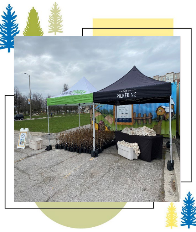
Take Pride in Pickering shrub giveaway

Take Pride in Pickering initiatives were a joint partnership with Environmental Stewardship Pickering (a partnership with the City, Ontario Power Generation, and Toronto and Region Conservation Authority).