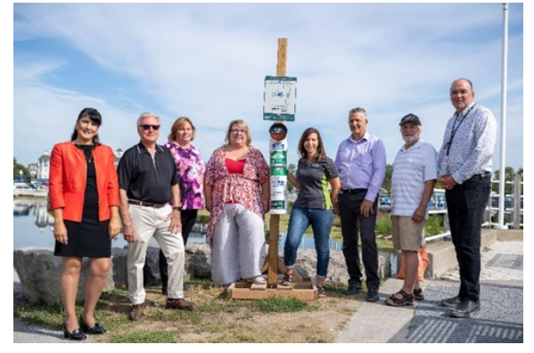
Clear Your Gear installation at Pickering waterfront

The collected line is shipped to a special recycling facility. Recycled monofilament fishing line is used for many purposes, including the manufacturing of Berkley Fish Habs, that help attract fish and promote plant growth.