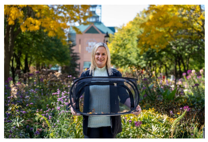
Butterfly release with Elexicon Energy

Elexicon Energy also funded an educational exhibit at the Pickering Central Library, where visitors could watch and learn inperson about the lifecycle of Painted Lady butterflies. These newly emerged butterflies were then released at a pollinator garden in Esplanade Park, that is maintained by the Pickering Horticultural Society.