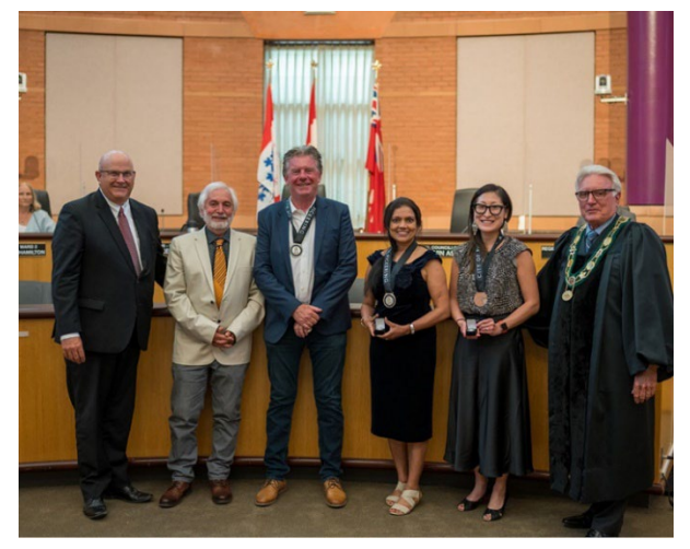
Elexicon Energy, Marshall Homes and Opus One Solutions were presented with the Sustainability Award for Altona Towns project

The Environment Award was provided to Chúuk, a Mexican inspired restaurant, that demonstrated its environmental efforts through the use of local foods and biodegradable materials in their business operations.