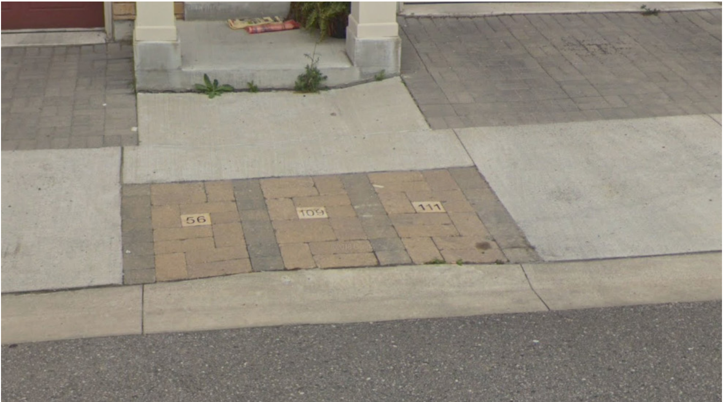
Figure 2 Example of collection pad in front of walk-up units for residents to place garbage and recycling bins on collection days

The proposed collection areas are along the internal access route of the development in front of each and every dwelling unit. The overhead clearance of 7 meters is provided for all obstructions including wires, balconies and trees. In front of the 3 storey single unit townhouses the residents would use their driveway as the collection point on a garbage or recycling pickup day. For the 3 storey walk-up units that have 3 separate units within them, a collection pad has been provided for each unit with the unit numbers identified on them. The collection pads are sized to fit 2 blue bins, a green bin, and two bags of garbage. See figure 1 for an example of the collection pads placed on the site in front of the Walk-up units.