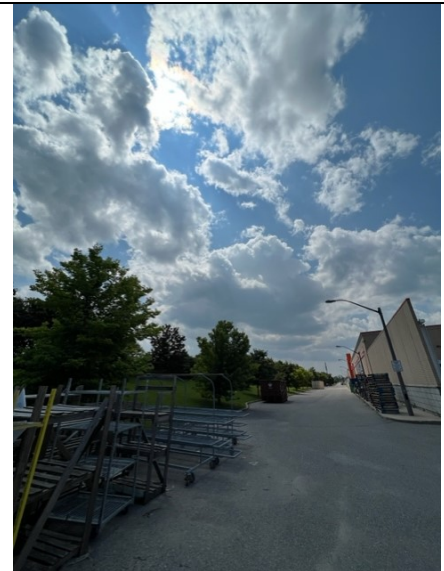
Image #12: View looking west along laneway running behind Home Depot (tree #593 in foreground)