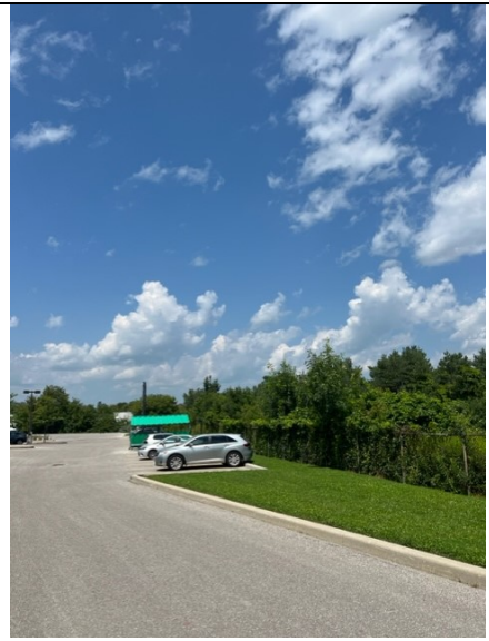
Image #15: View looking north along eastern portion of Food Basics parking lot