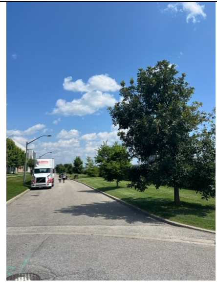
Image #9: View looking east from cul-de-sac along east-west laneway connecting to Dixie Road