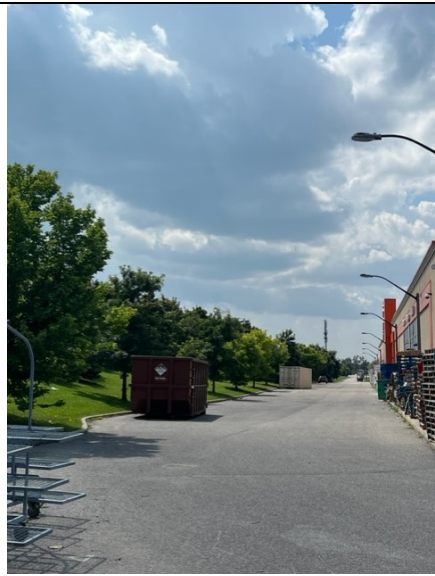
Image #13: View looking west along laneway running behind Home Depot