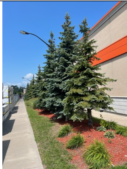
Image #11: View looking north along private road running parallel with Home Depot