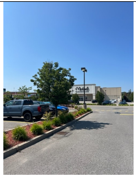
Image #6: View looking west along Walnut Lane (north end of Home Depot parking lot)