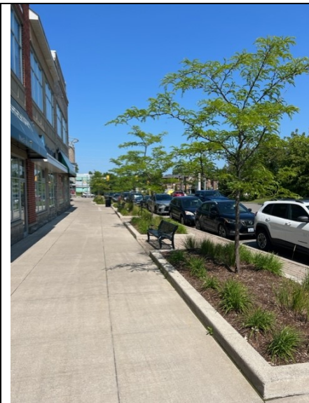
Image #4: View looking north along Walnut Lane towards Kingston Road