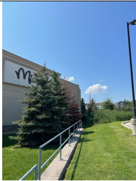
Image #7: View looking west towards group of conifer trees (#553 in foreground)