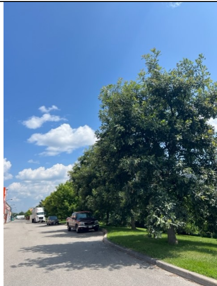
Image #10: View looking east along laneway running behind Home Depot