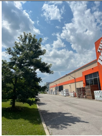
Image #14: View looking west along laneway running behind Home Depot