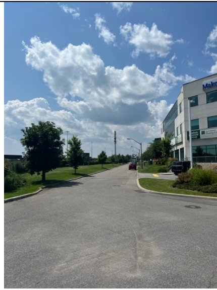
Image #8: View looking west along east-west laneway connecting to Dixie Road