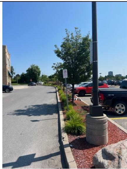
Image #5: View looking east along Walnut Lane (north end of Home Depot parking lot)