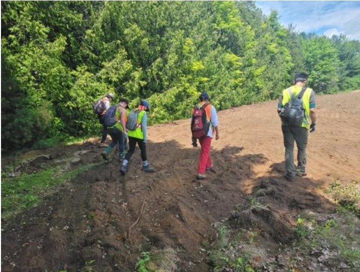
Image S1: Reduced pedestrian survey transect intervals at the P1 Findspot.