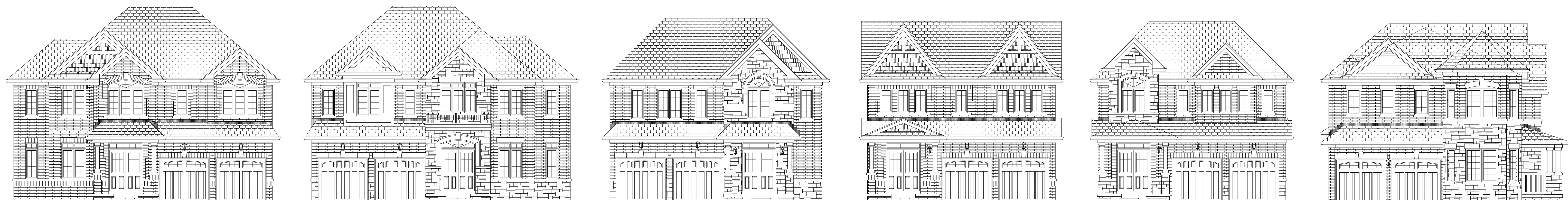
LOT 8 MODEL B FRONT ELEVATION 2