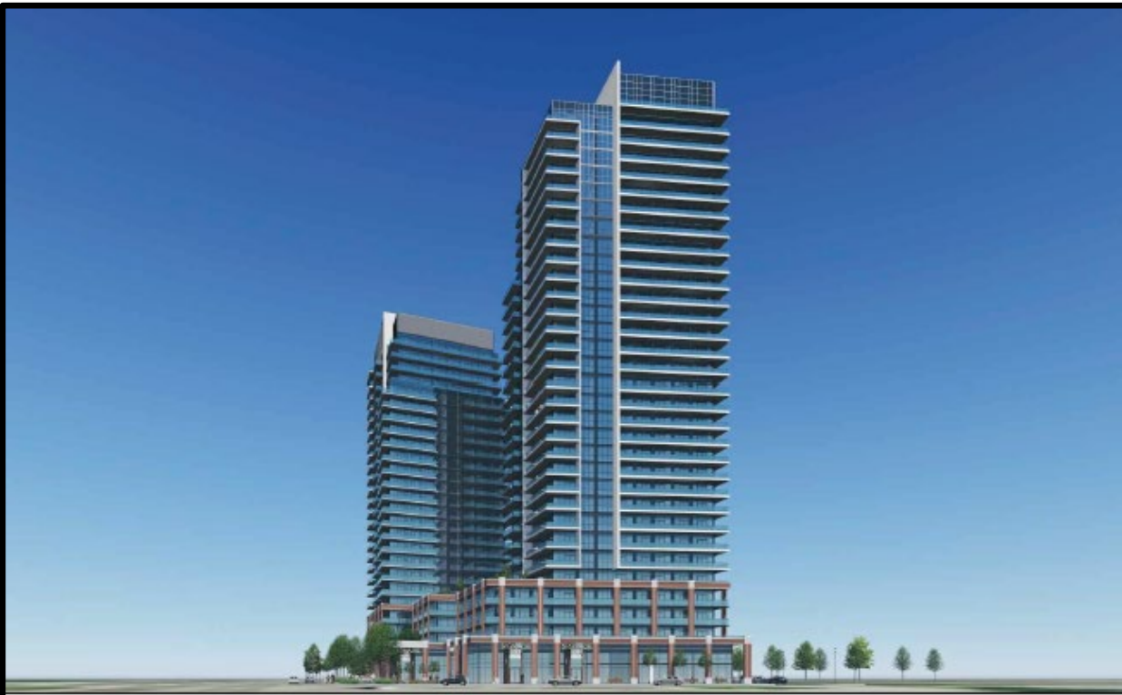
View looking east from the intersection of Kingston Road and Rougemount Drive