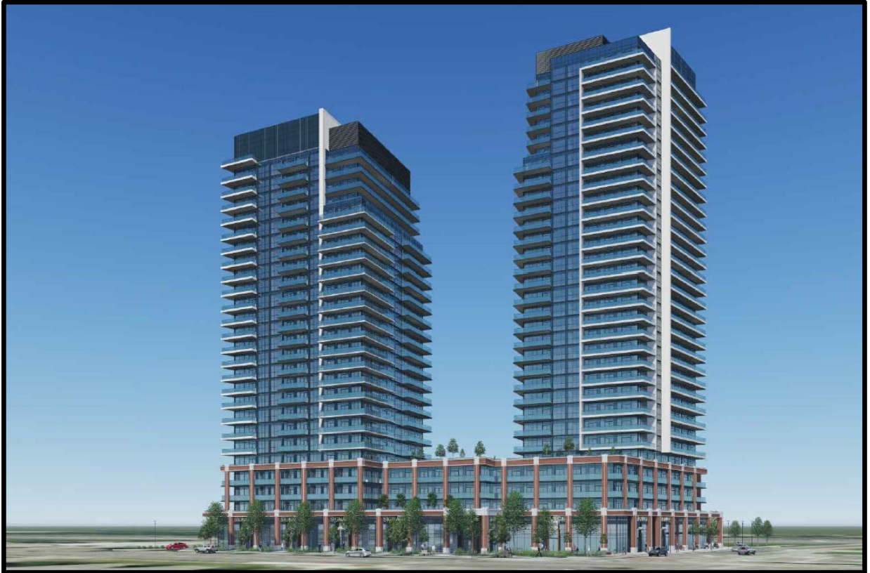
View looking south from the intersection of Kingston Road and Rougemount Drive