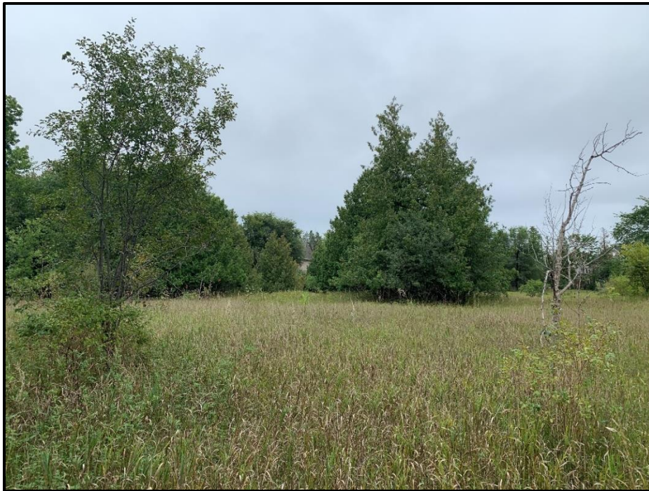
Photograph 2. Dominant Meadow Community (CUM1-1; September 9, 2020)

A meadow community was located centrally ( Photograph 2 ). This area was characterized as a CUM1-1 unit based on the dominance of herbaceous meadow species including asters ( Symphotrichum spp.), goldenrods ( Solidago spp.), grasses ( Bromus inermis , Dactylis glomerata ), Common Milkweed ( Asclepis syriaca ), Queen Anne's Lace ( Daucus carota ) and extensive patches of Tansy ( Tanacetum vulgare ). Sparse occurrences of European Buckthorn were noted, along with patches of honeysuckle ( Lonicera sp.).