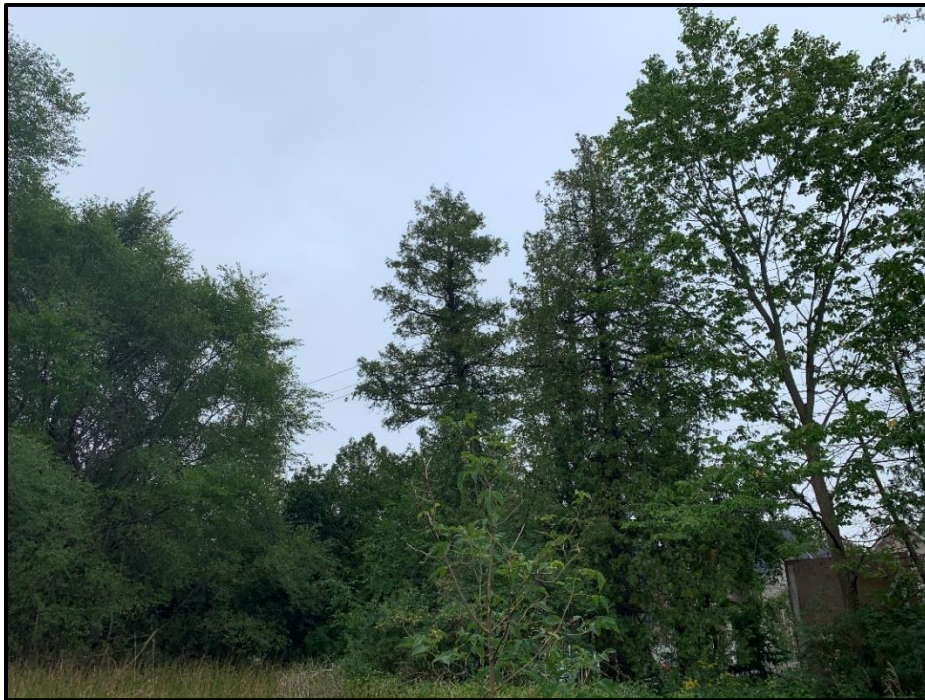
Photograph 1. Remnant Coniferous Hedgerow (September 9, 2020)

A remnant hedgerow was delineated in the southeastern portion of the property that appeared to have previously encircled a formed homestead. The hedgerow is entirely composed of Eastern White Cedar ( Thuja occidentalis ) trees of varying ages and size, however maintained a linear and evidently planted nature ( Photograph 1 ).